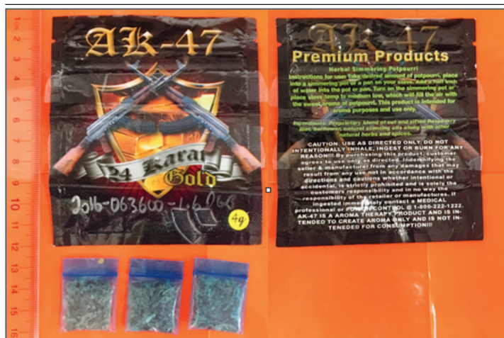
Figure 3. AK-47 24 Karat Gold Foil Wrapper Containing Herbal Products Recovered from a Patient Involved in the Outbreak.

Also shown are three of the eight small blue bags containing aliquots of the agglutinated herbal material.